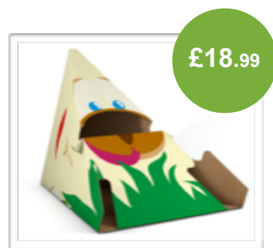
Plicopá White canvas